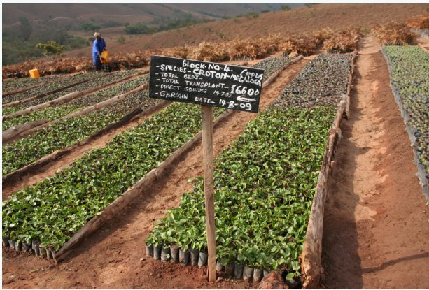
Seedlings being grown ready to plant in the forest.

As part of its commitment to supporting the local communities around the project area, the project developer has made considerable investments in classrooms, teachers' and nurses' accommodation and village government buildings. Construction of teachers' houses will enable more consistent teaching and overcome the high turnover and irregular attendance of teachers at the school who currently have to rent sub-standard accommodation some distance away. In addition, a nurses' house in Mapanda village will help the local health centre provide a more reliable health service locally.