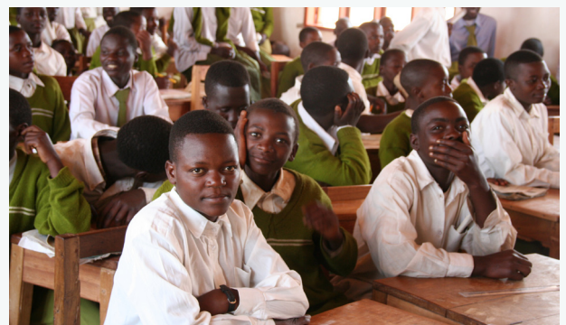
The village government office and classrooms, paid for by the project.