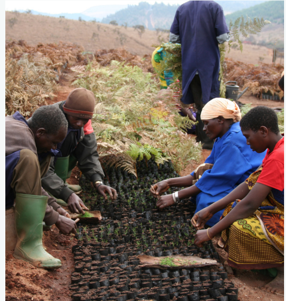
Project members tending seedlings for planting.

The VCS rules require that carbon credits sold from all A/R projects must adhere to 'ex-post' accounting: credits verified for sale can only correspond to carbon sequestered in the past, not in the future (ex-ante).