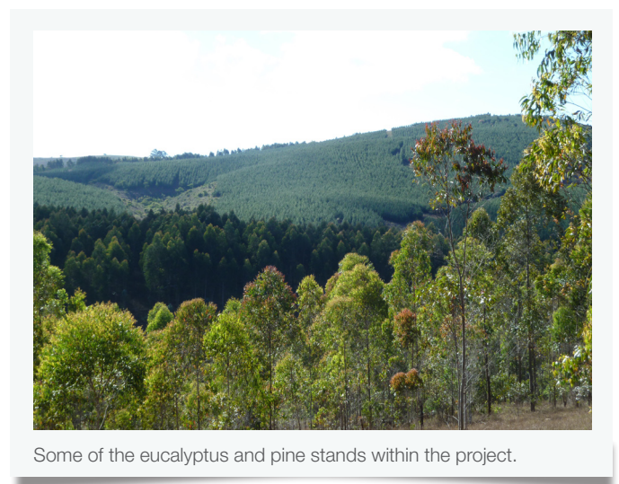
Some of the eucalyptus and pine stands within the project.

Ten per cent of the carbon revenues from the forests have been allocated to initiatives which will benefit the local communities. The decision on how to spend this money is agreed with the local villages based on their list of priorities. The project provides ongoing employment opportunities plus training on land-use planning, conservation and sustainable forest management. Infrastructure improvements include the development of approximately 200 kilometres of new roads and 100 kilometres of road renovations plus improved road signaling and signs. Access to potable water has increased through the construction of bore holes in villages and social services have improved with the building of schools and hospitals.